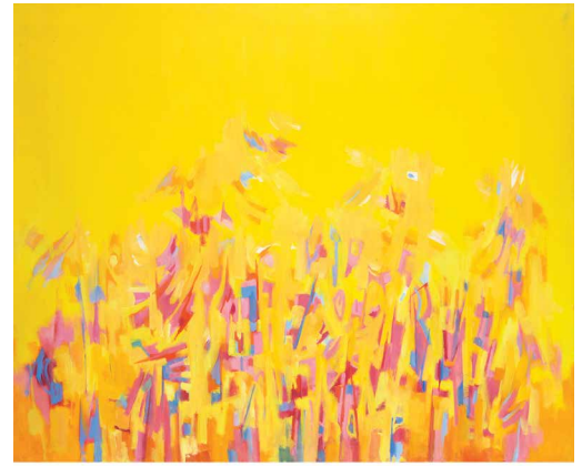
Norman Lewis. Afternoon. 1969.